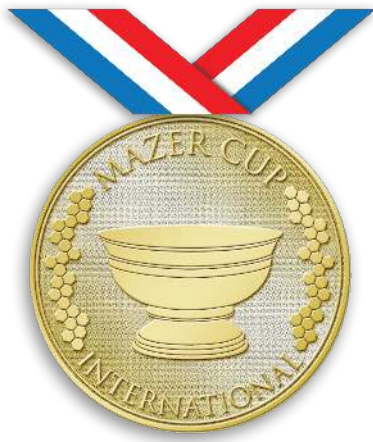
2019 SILVER MEDAL - DRY METHEGLIN MEAD